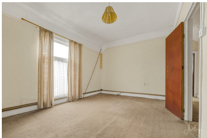
Bedroom 2 11'5" x 10'5" (3.49m x 3.18m)

Double glazed window to side, cupboard, picture rail, fitted carpet.