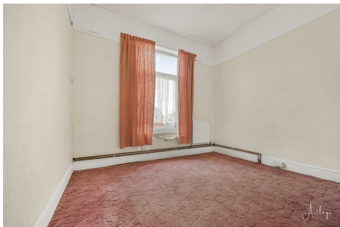
Bedroom 3 11'0" x 10'6" (3.36m x 3.19m)

Double glazed window to side, picture rail, fitted carpet, radiator.