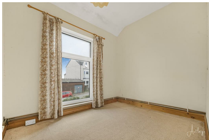
Bedroom 4 9'8" x 7'7" (2.94m x 2.32m)

Double glazed window to side, picture rail, fitted carpet, radiator.